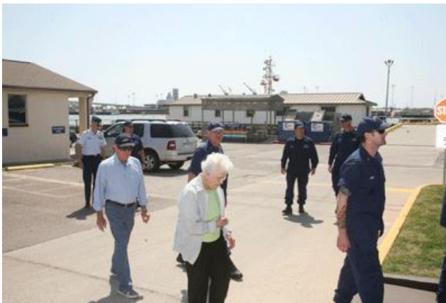
Coasties filing in to the Harbor Facility