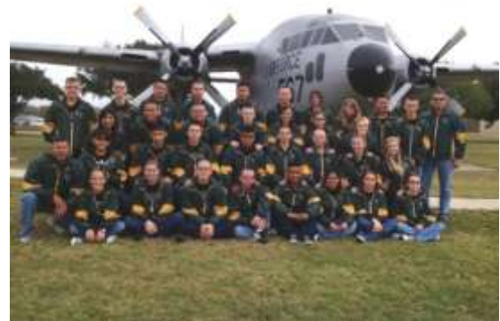
RFHS NJROTC Cadets at a static display on the Lackland AFB Parade Grounds.

In December we have continued our community service efforts by assisting the Good Samaritans, the City of Fulton for the Winter Texan Fish Fry, the R-F Chamber of Commerce with the Holiday Luncheon, and the Texas Maritime Museum for the Belle Ball. We also hosted, for the 2 nd year, our very own JROTC drill meet, the Coastal Bend Classic, at the RFHS campus on Saturday, December 8th. Over 450 cadets from 15 high schools attended, from areas including Houston, San Antonio, Corpus Christi, and the Valley. The weather was terrific, the participants were awesome, and the support from local parents and our active and reserve military was incredible. We had over 40 active and reserve Navy, Marine Corps, and Army personnel act as judges and inspectors for the event. Many thanks to our friends and visitors who came by to offer support.